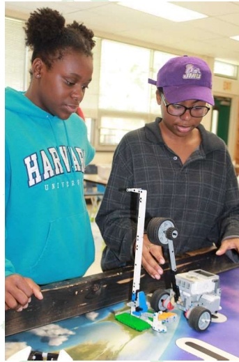
Compass Youth Center came and students were able to explore with coding programs.