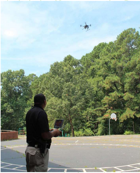
Orange County Sheriff Department came to discuss the use of drones.