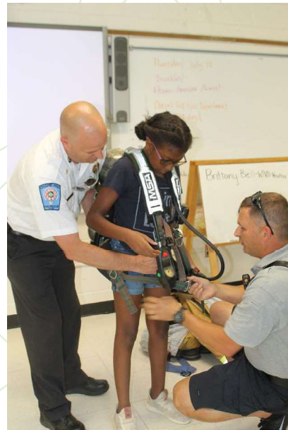
Chapel Hill Fire Department taught the students about fire fighting technology, guided students through production of public safety announcements, allowing students to wear equipment and exploring a fire truck.